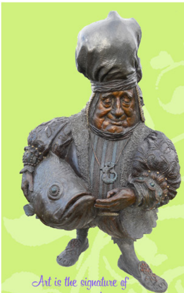
Art is the signature of civilization! Beverly Sills

Springville, Utah's "Art City," is an art lover's dream. Nearly 60 statues created by talented local artists (in conjunction with nearby foundries) are on public display and tell stories of delight and wonder. Sculpture has long been Utah's strongest art medium, and the "Statues to Live By" program, funded by friends and supporters of the arts and the Springville Arts Commission—which oversees the purchase, maintenance and placement of the artworks—has added another chapter to Springville's rich artistic legacy.